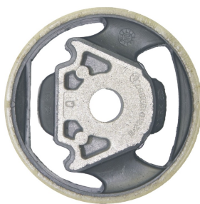
FROM MID 2008 ON

In addition to the Road Series parts listed please check the Black Series website for other bushes suitable for this car that may be more suited to Track/Race use.