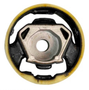
Use PFF85-830 Or PFF85-831 For OEM part number 5Q0198 037 A