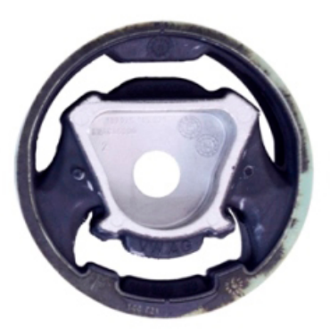
Use PFF85-832 Or PFF85-833 For OEM part number 5Q0198 037 B

In addition to the Road Series parts listed please check the Black Series website for other bushes suitable for this car that may be more suited to Track/Race use.