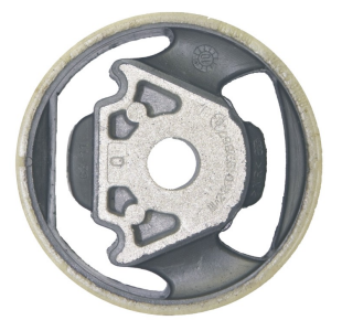
UP TO MID 2008