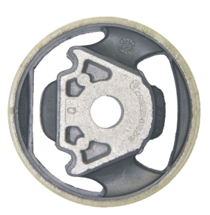
FROM MID 2008 ON