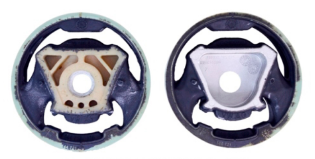
Use PFF85-832 Or PFF85-833 For OEM part number 5Q0198 037 B