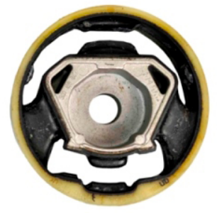
Use PFF85-830 Or PFF85-831 For OEM part number 5Q0198 037 A